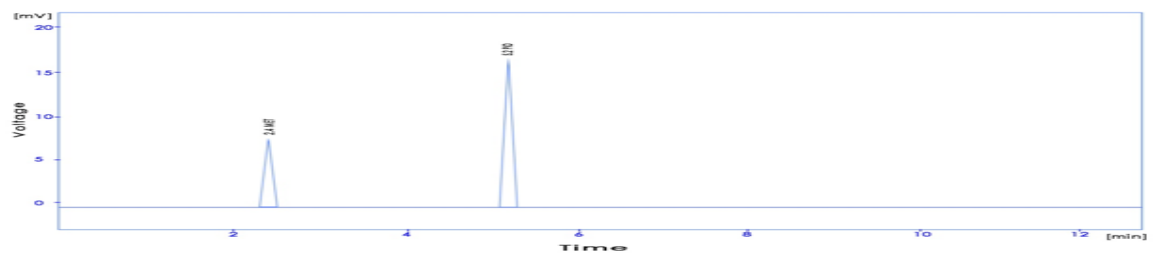
Fig 3: HPLC chromatogram of metformin and pioglitazone

Lots of mobile phase and there different conc. We tried and finally selected acetonitrile and phosphate buffer in ratio 65:35 at pH 3.4 approx. Mobile phase which gave good resolution and acceptable system suitability parameter. The chromatogram of working std. soln. is shown in fig 3.